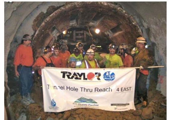
Crew members pose in front of the tunnel breakthrough near the Central Shaft.

Crews are now installing 50-foot-long steel pipe segments in the eastern half of the tunnel between the San Vicente Portal and Central Shaft. Once in place, crews pump grout material outside the pipe to secure it within the tunnel. It will take about 3 million cubic feet of grout for the entire tunnel, enough to fill more than 6,000 backyard swimming pools. The final step will be applying a cement mortar lining to the inside of the pipe to protect it from corrosion. The contractor anticipates completing all phases of the pipe installation work for the eastern half of the tunnel in the spring.