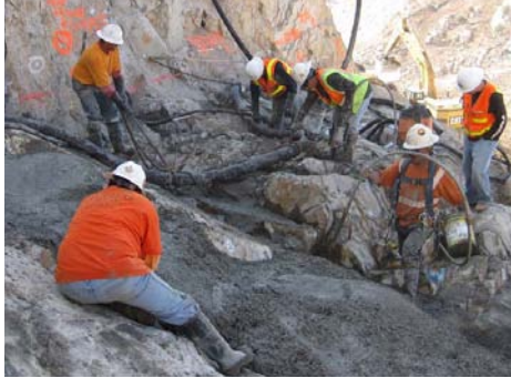
Representatives from California's dam safety regulator inspect the work as crews place concrete to build a strong foundation for the new dam.

Now that construction is in progress, DSOD staff members visit the work site regularly to inspect construction in the field and ensure that the work meets dam construction standards. These inspections will continue throughout construction. Once the work is complete, DSOD will also oversee the refilling of the reservoir and inspect San Vicente Dam annually, as it does for all dams in the state.