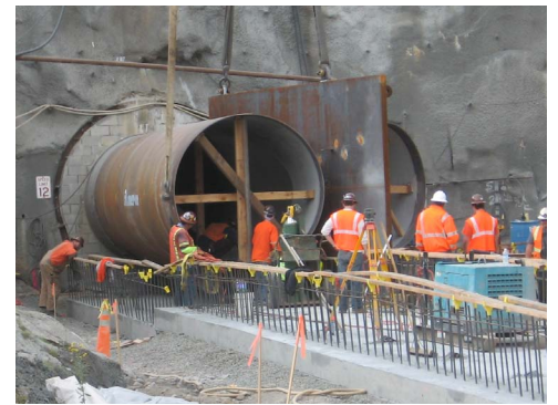
The front of the Y-shaped pipe emerging from the San Vicente Portal.

All work for the San Vicente Pipeline project is expected to be complete late this summer. In times of future water supply emergencies, the Water Authority will activate the San Vicente Pipeline, along with other facilities, to move water from San Vicente Reservoir to the countywide water distribution system. 💧