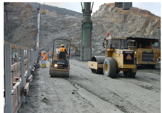
Roller-compacted concrete will be placed in layers using rollers, similar to those used for building roads.

Three smaller phases of work will follow the dam raise: building a new marina, relocating a pipeline above the new high water level, and restoring construction areas. Originally, this work was going to be done at the same time as the major dam raise construction. However, the Water Authority has modified this schedule, so the smaller projects will begin after the dam raise is done. All construction activities are expected to be complete by mid-2014.