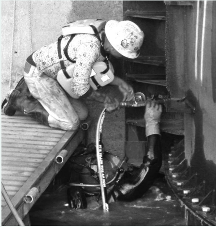
Professional divers worked as deep as 80 feet under water to secure the cofferdam to San Vicente Dam.

The cofferdam was constructed of 14 semicircular sections, each measuring 8 feet tall and 32 feet wide. Two floating barges, together the size of a baseball diamond, transported the giant cofferdam sections across the reservoir to the dam and served as a staging area for assembly. Computer-controlled hydraulic jacks installed on top of the dam hoisted cofferdam sections from the barge, assembling one section below the other. Workers then bolted the sections together.