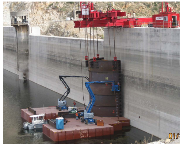
Hydraulic jacks at the top of the dam held the cofferdam in place during installation.

There are many pieces to the San Vicente Dam Raise puzzle. Two vital pieces of this massive project came together this spring: a 200-ton steel enclosure on the water side of the existing dam and a tunnel through the dam. These interrelated tasks were fitted into place by specialized crews.