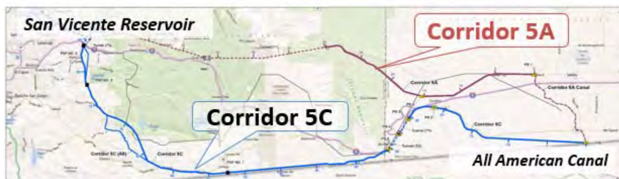
Figure 1. Alignments 5A and 5C of Alternative Colorado River Conveyance Facilities

Environmental permitting and compliance necessary to implement the project that was analyzed in the 1996 Black and Veatch study was found to be largely unchanged as part of the 2013 facilities master plan update, which included new information obtained from the construction of San Diego Gas & Electric's Sunrise Powerlink project and the 2008 Eastern San Diego County Resource Management Plan. Water quality and treatment options for the highly saline Colorado River water were a significant consideration in the facilities master plan analysis, wherein both a centralized treatment facility in Imperial Valley and blending options in the San Vicente Reservoir were considered. Due to its lower cost, the San Vicente blending option was chosen over a centralized treatment in the Imperial Valley. The Imperial Valley option would have also included the loss of approximately 21,000 AF per year due to the reverse osmosis treatment process.